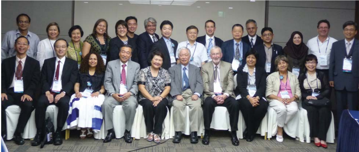
photos from the AOCNA National Delegates Meeting

(start-up and yearly maintenance) and other miscellaneous expenses is estimated to cost USD$9,600. Thus, the yearly and life membership fee received from new members is sufficient to cover the AOCNA Home Page and other operational costs. However, the estimated yearly income is insufficient to cover additional costs such as the travel expense for the