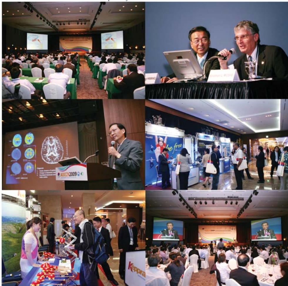
photos from the 10th AOCCN

Thank you again and goodbye until the next 11th Congress, Brisbane, Australia in 2012.